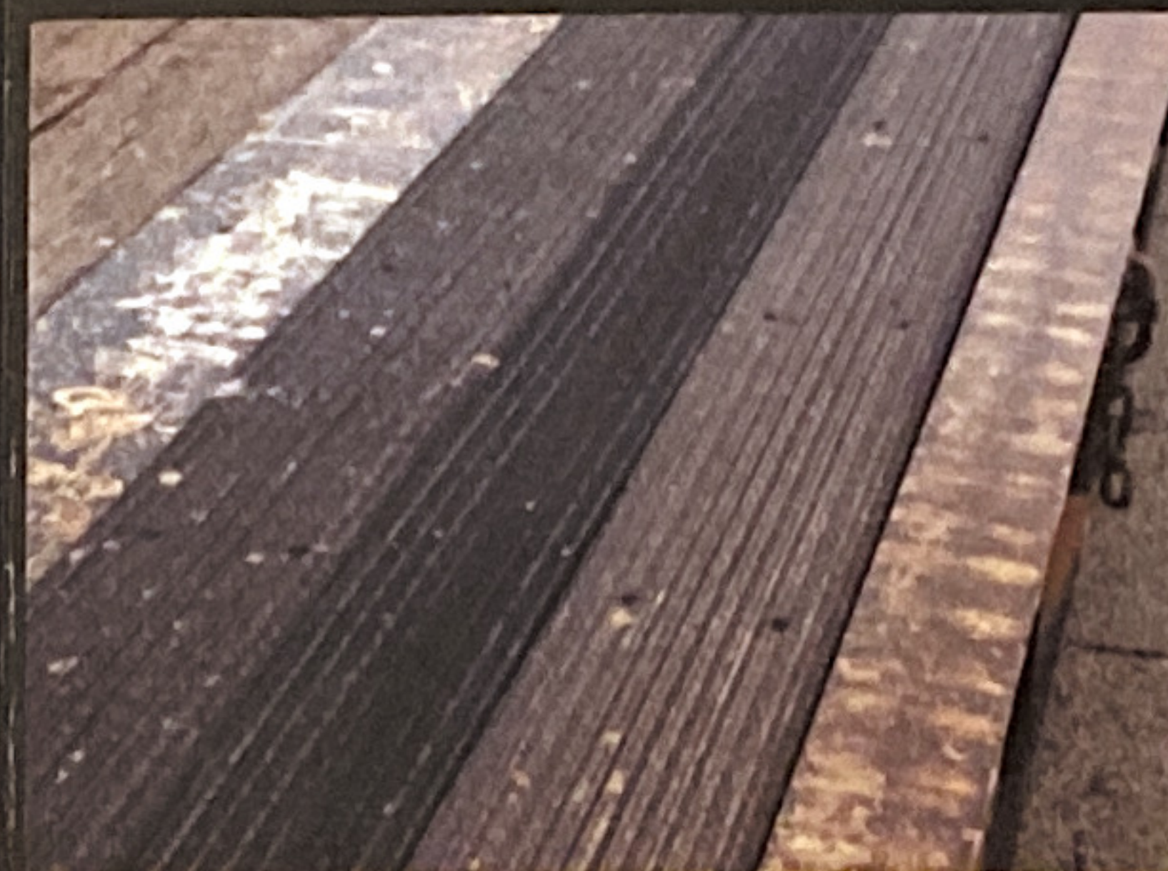
Heavy Equipment Trailer Decking