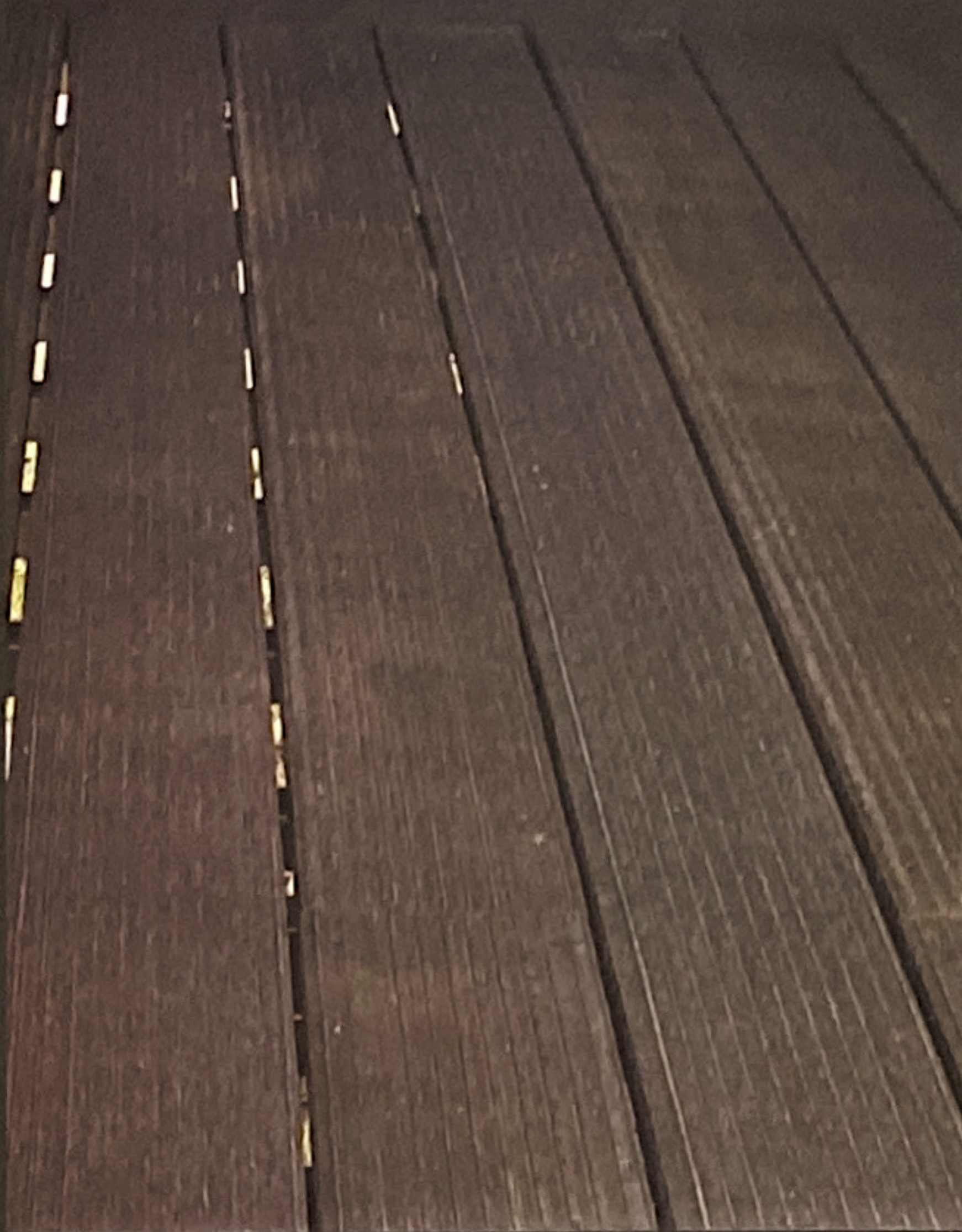
Livestock Trailer Flooring