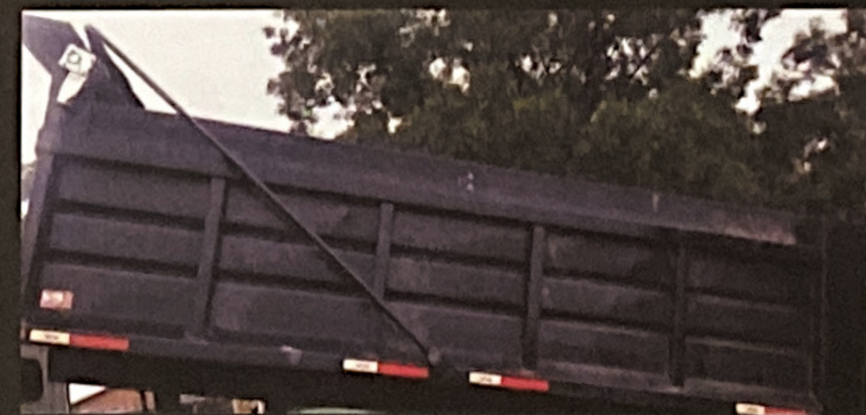
Plank Board Smooth for Extension Boards

Alternative to Wood or Other Composite Material