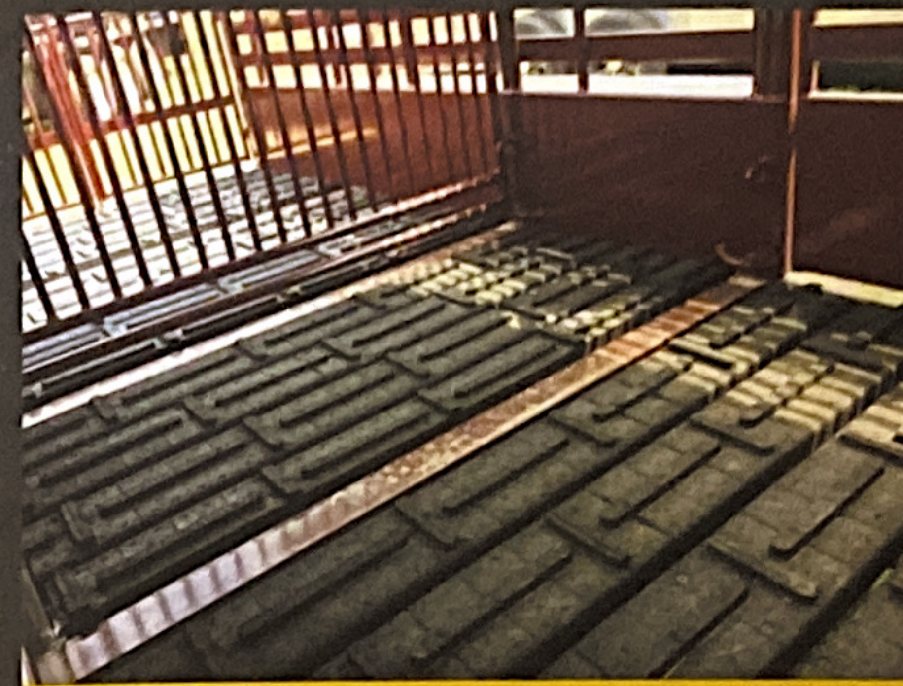
Extends The Life of Your Trailer -Less Maintenance