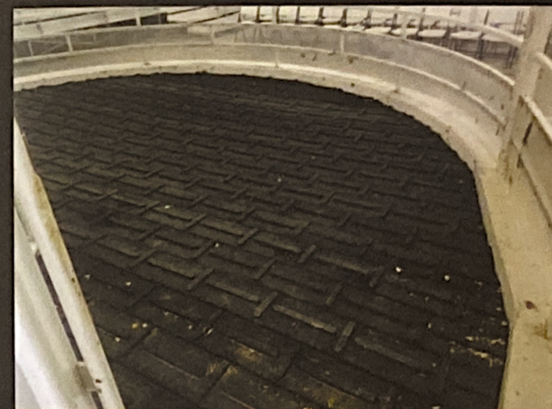
Flooring for Livestock Sale Barn