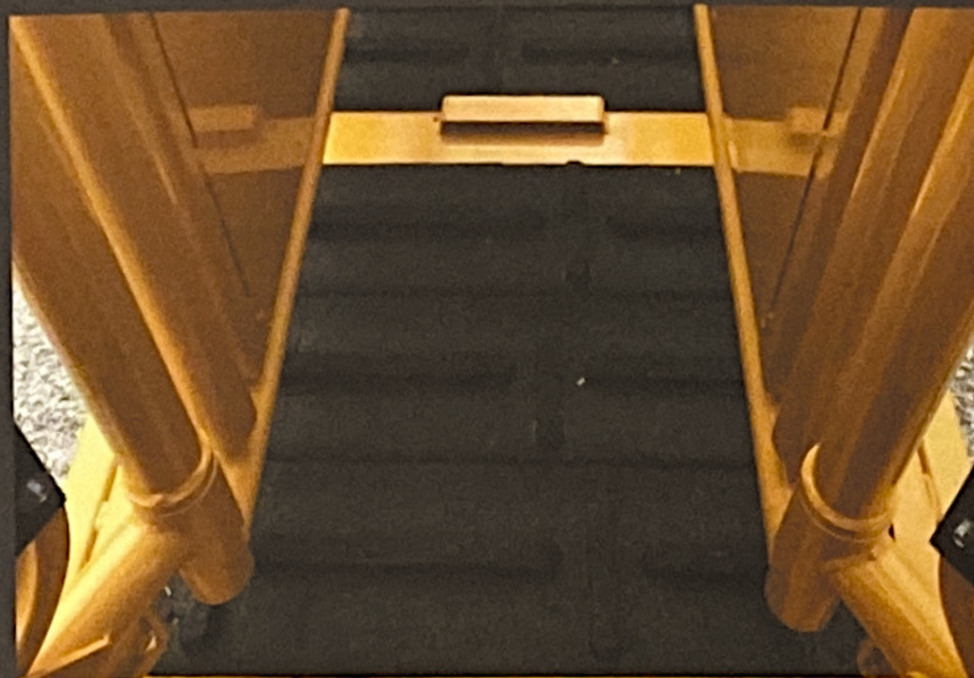
Perfect Match for Livestock Equipment