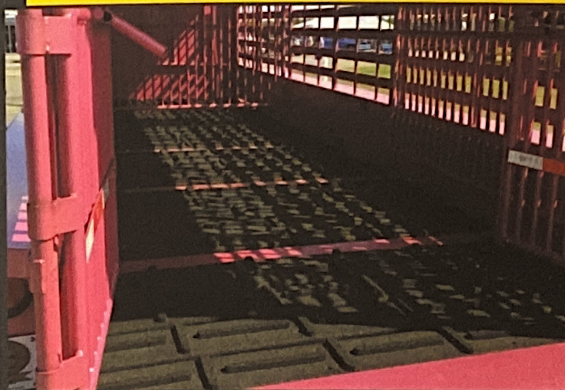
Livestock Trailer Flooring